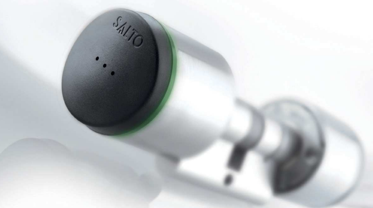
XS4 GEO cylinder