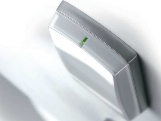
Functional test in manufacturing