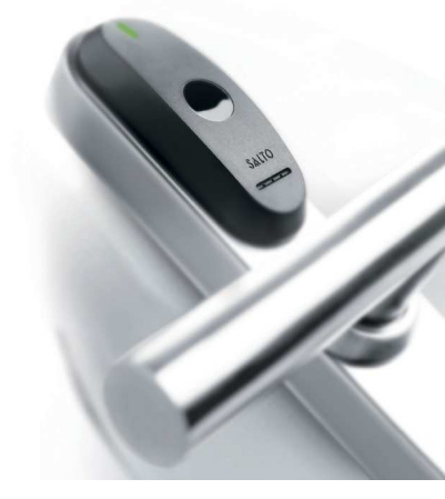
Component testing in development